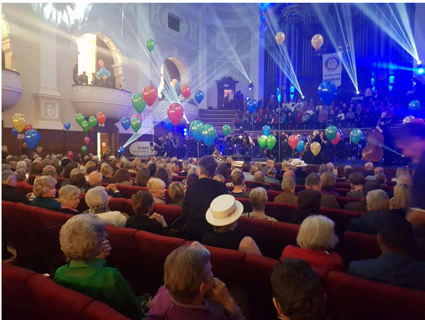
Proms: Sound and Light Spectacular